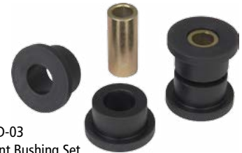
TCP MM-FD-03 Replacement Bushing Set Includes : 4 bushings, 2 sleeves

Our poly-urethane bushed motor mount assemblies provide a high performance, direct replacement alternative to bonded rubber factory mounts and are available for small block and big block applications. A unique, double-shear, through-bolt design eliminates any chance of motor mount separation during normal use. Fixed-style mounts use shims on either side of the urethane bushing to allow the fore/aft position of the motor to be varied within a 1/2" range centered at the stock position. Adjustable-style mounts (small-block only) feature a slotted engine plate allowing three inches of adjustment centered at the stock position. The mount features graphite impregnated poly-urethane bushings with seamless internal sleeve and external housing. Transferred vibration is increased over factory levels but without the harshness commonly found using completely solid mounts.