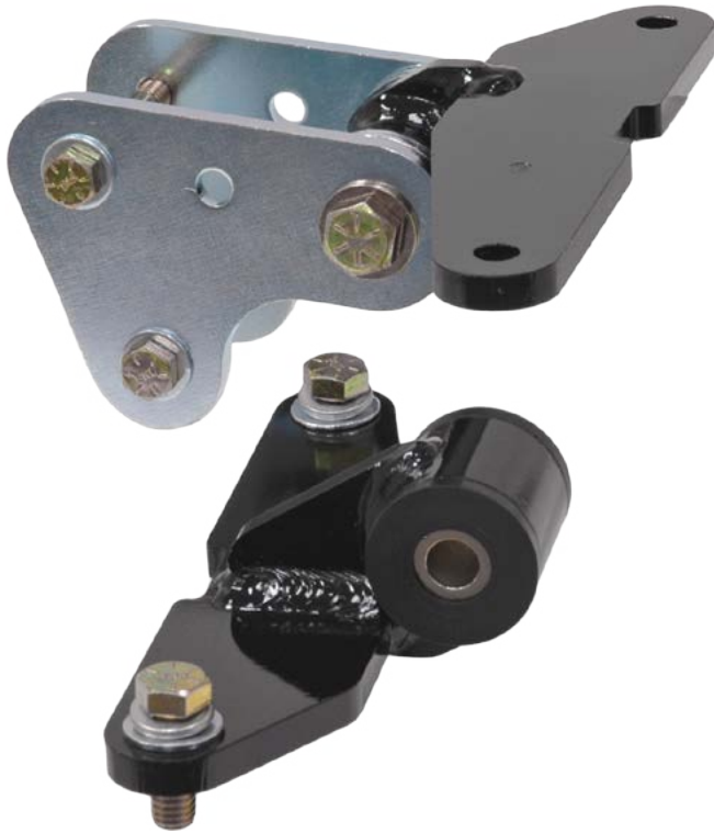
Fixed-Style Mount (TCP MM-FD-02)