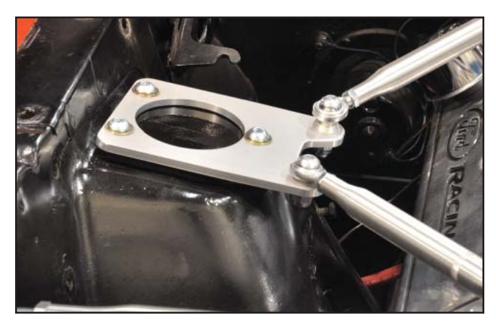
Full Coil-Over mounted BELOW - standard ride-height