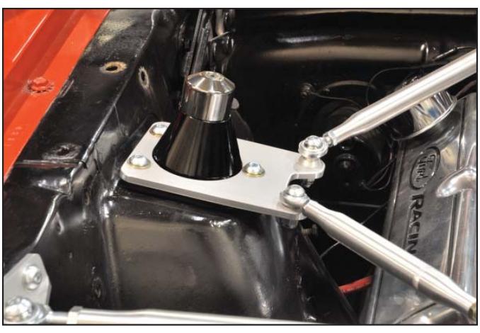
Bolt-On Coil-Over mounted BELOW - standard ride height

Placing the coil-over mount ABOVE the tower-brace plate lowers the ride height approximately 1/2".