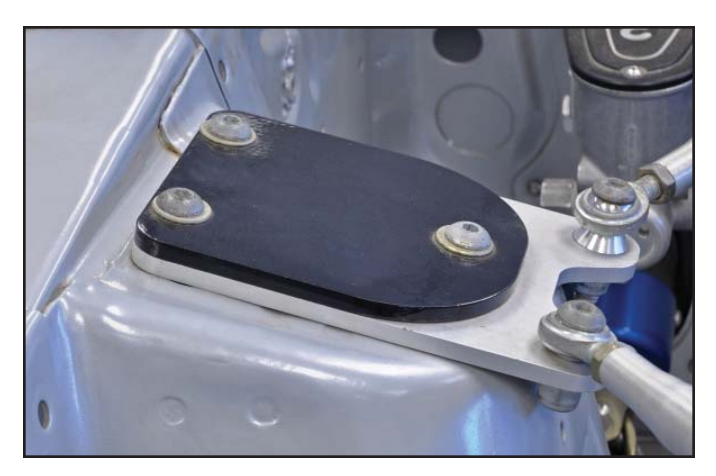
Full Coil-Over mounted ABOVE - lowered ride height